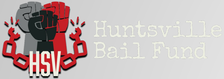
Primary Logo Color Variant