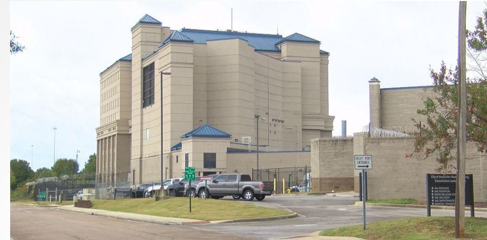
Madison County Jail, located in Huntsville, AL, houses more than 800 individuals on average, many of whom are detained without being convicted of a crime.

Huntsville Bail Fund believes no one should be left behind in jail solely because of poverty. Freedom should be free. We seek to address the disproportionate impact of the cash bail system on vulnerable populations in Madison County, including communities of color, gender and sexual minorities, those with disabilities, and immigrants, by providing cash bail assistance and limited reentry services.