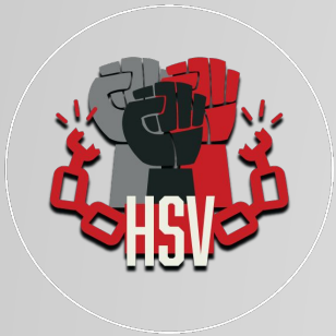
Alternative Icon Logo